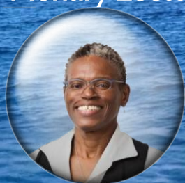
Pr Dame Ijeoma Uchegbu Peptide nanoparticles