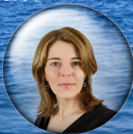
Pr Silvia Ortega Gutiérrez Chemical Probe